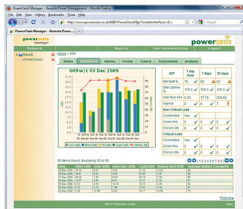
The PowerOasis Manager Dashboard

PowerOasis Manager is a centralised remote monitoring, control and configuration solution for multiple PowerOasis Controllers deployed within a communications service provider's radio access network. Using either a SMS/GPRS modem or a TCP/IP connection over the backhaul, monitoring data and control messaging is communicated between the PowerOasis Controllers and the PowerOasis Manager. Site availability is maximised through preventive and corrective equipment maintenance combined with metering of diesel usage to avoid fuel related outages. Operations and maintenance costs are minimised due to reduced site visits for maintenance and diesel refuelling.