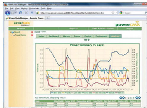
PowerOasis Manager Analysis Screen

PowerOasis Manager is an integral component in our wireless network power management solutions, which provide a platform to deliver power related services that eliminate wasted energy, optimise power costs and maximise site availability.